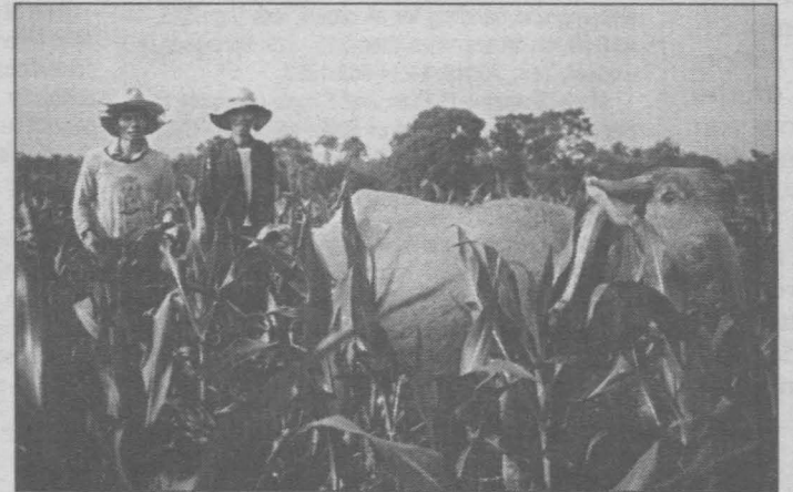
A LITTLE COOPERATION—At one co-op, female carabaos, used to plow and transport crops, will be shared among farmers to increase earnings.

being treated as such. They may be happier than we are—don't ruin it!